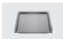
Enamelled baking tray

Nikpol | 1300 645 765 | www.nikpol.com.au | sales@nikpol.com.au